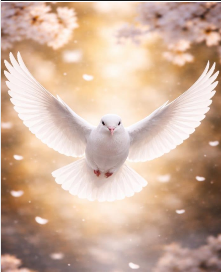
(This is a pedagogical image.)